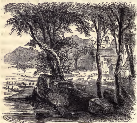
THE MILLMAN'S HOUSE

A road led to the house, but did not go beyond it. The house was small, but it had